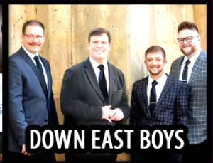
DOWN EAST BOYS